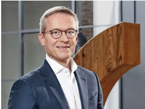
Dr Karsten Wildberger, Chief Executive Officer